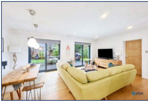
Kitchen / Living Area