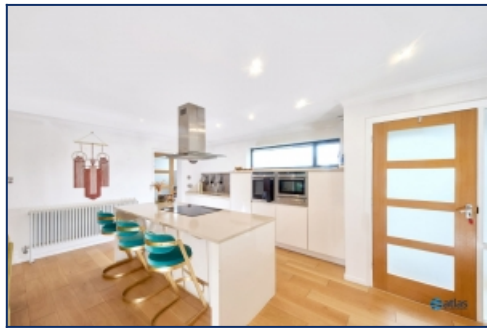
Kitchen / Living Area