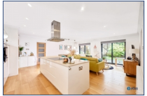
Kitchen / Living Area