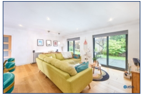
Kitchen / Living Area