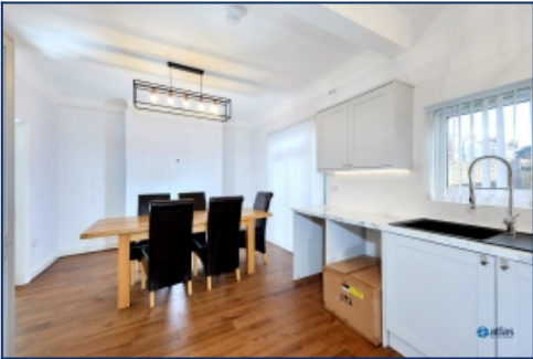
Dining / Kitchen