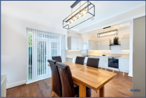
Dining / Kitchen

Schedule your viewing today and let Victoria Road become your new home!