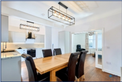
Dining / Kitchen