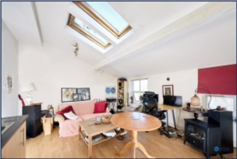
Living / Kitchen Area