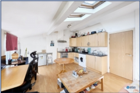
Living / Kitchen Area