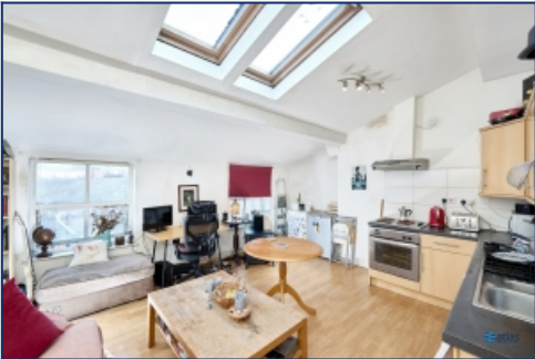
Living / Kitchen Area