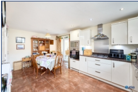
Open Plan Kitchen And Dining Space