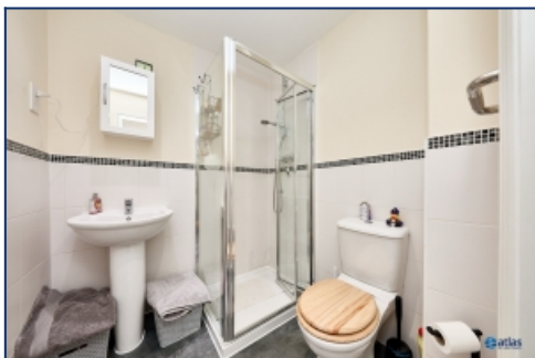
En-suite To Bedroom One