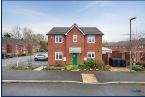
Front Elevation Of Property