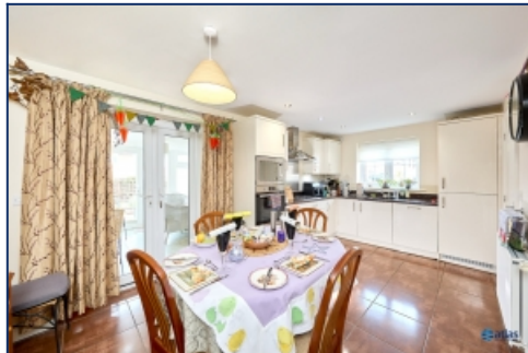
Open Plan Kitchen And Dining Space