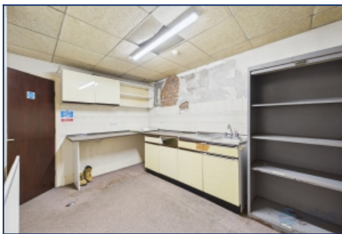
Commercial Second Floor