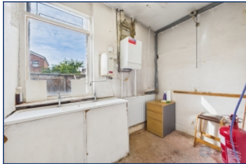
Commercial Ground Floor