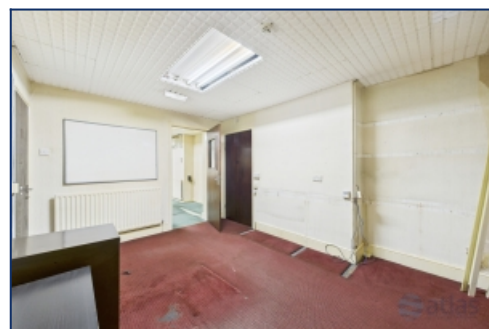
Commercial Third Floor