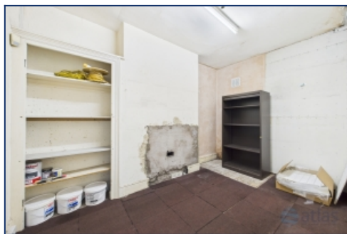
Commercial Second Floor