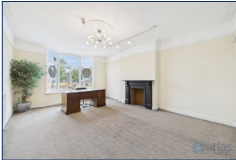
Commercial Second Floor