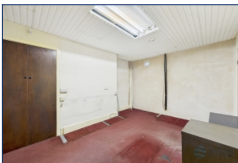
Commercial Third Floor