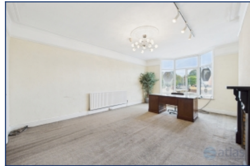
Commercial Second Floor