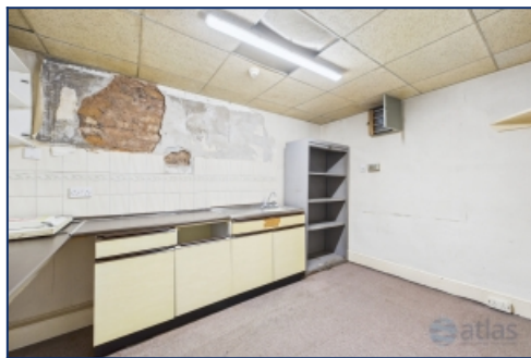
Commercial Second Floor