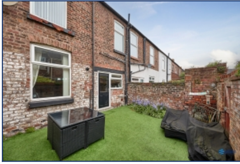
Rear Elevation Of Property