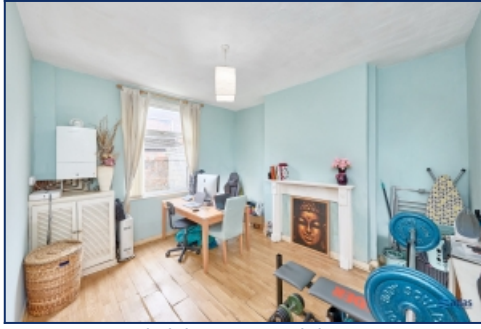
Second Living Space/Dining Space