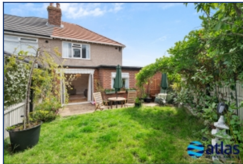
Rear Elevation Of Property