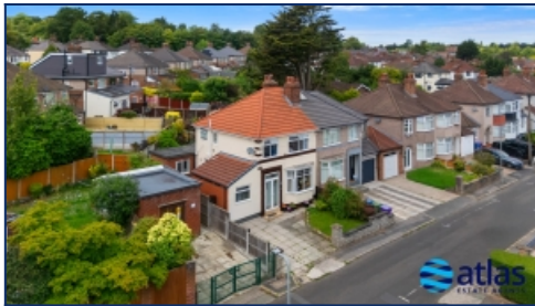
Front Elevation Of Property