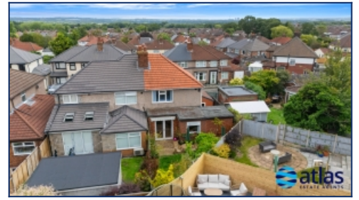
Rear Elevation Of Property