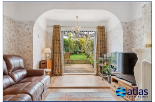
Second Living Space