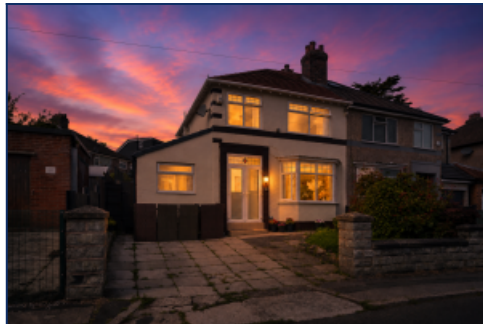
Front Elevation Of Property (night Shot)