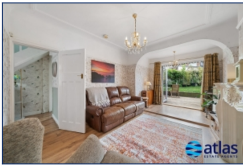
Second Living Space