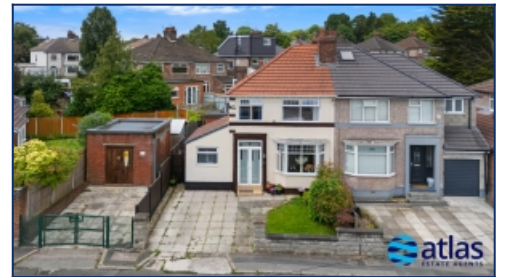
Front Elevation Of Property