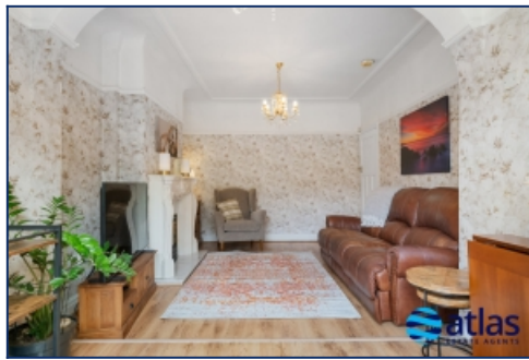
Second Living Space