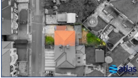
Aerial View Boundary