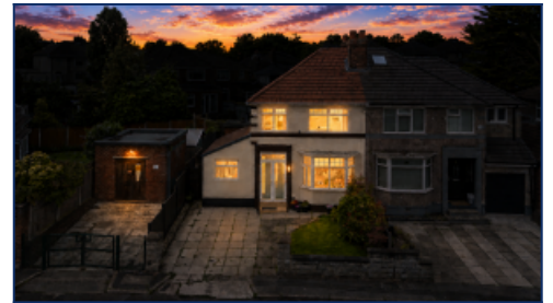
Front Elevation Of Property (night Shot)