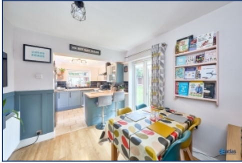
Dining Room / Kitchen