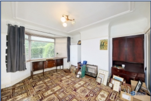
Front Reception Room