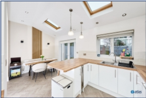
Dining Area / Kitchen