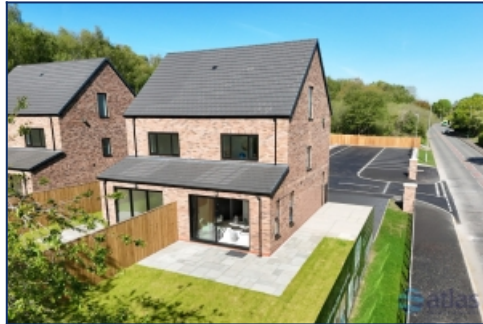
Aerial View Of Garden