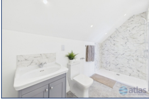
Master Bedroom En-suite