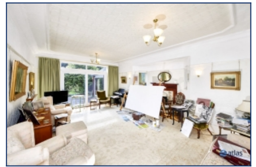
Reception Room 1