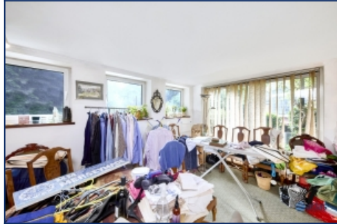
Reception Room 2