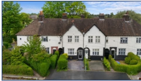
Aerial View Of Property