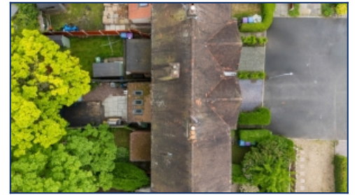
Aerial View Of Property