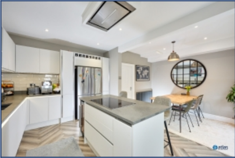
Kitchen / Dining Area