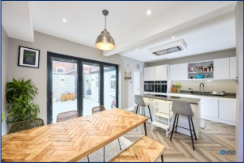
Kitchen / Dining Area