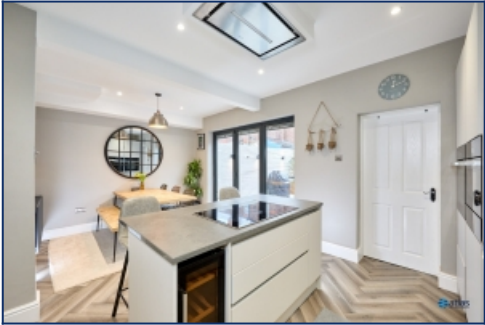
Kitchen / Dining Area