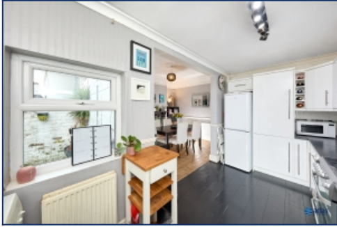
Kitchen / Dining Room