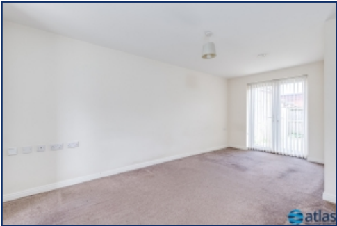
Reception Room 1