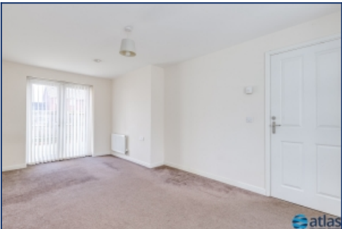
Reception Room 1