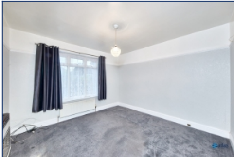
Dining / Living Area