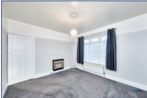
Dining / Living Area