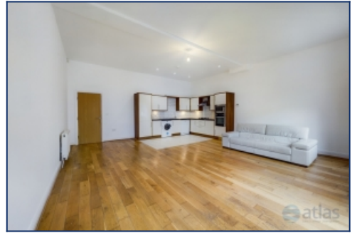
Kitchen / Living Area