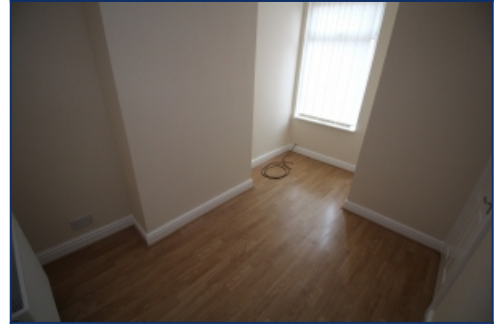
Bedroom 2 - 2