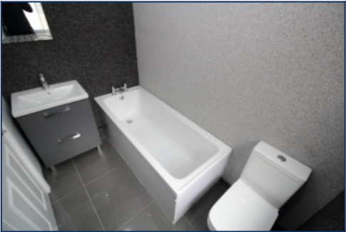
Ground Floor Bathroom