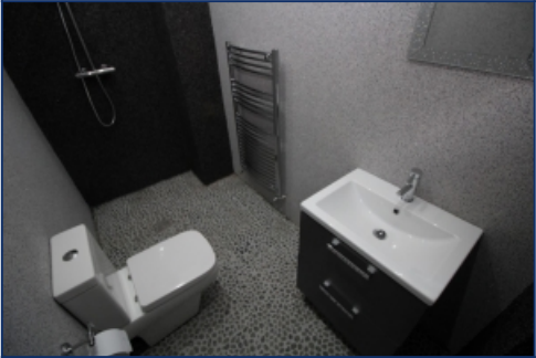
First Floor Bathroom