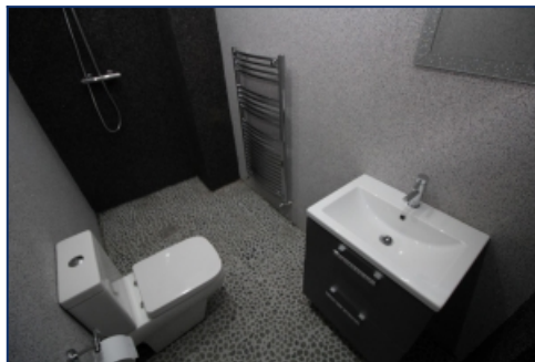
First Floor Bathroom