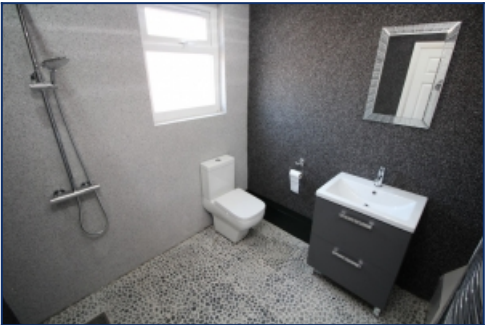
Bedroom 5 En-suite

A rare opportunity to enjoy high-end accommodation in a sought-after location. Enquire now to secure your place in this exceptional house share.