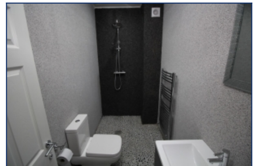
First Floor Bathroom