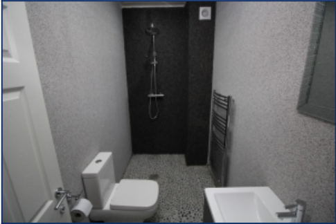
First Floor Bathroom