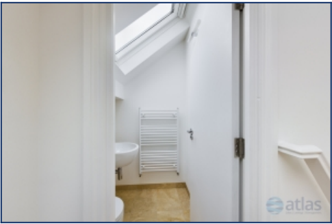
Loft Bedroom En Suite