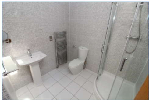
Bedroom 1 En Suite