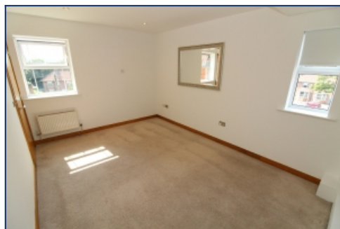
Bedroom Or Reception Room