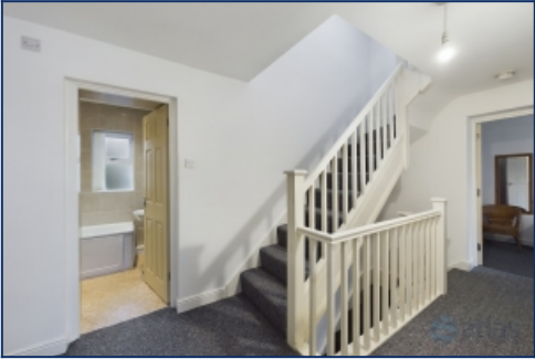
First Floor Landing

This residence stands as a testament to the Atlas Estate Agents' commitment to excellence, offering a haven of comfort, sophistication, and modernity. Don't miss the opportunity to call this spacious three-storey townhouse home - where every detail is curated for an exceptional living experience!