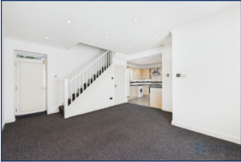
Living / Kitchen Area