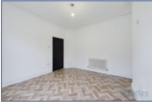
Front Reception Room