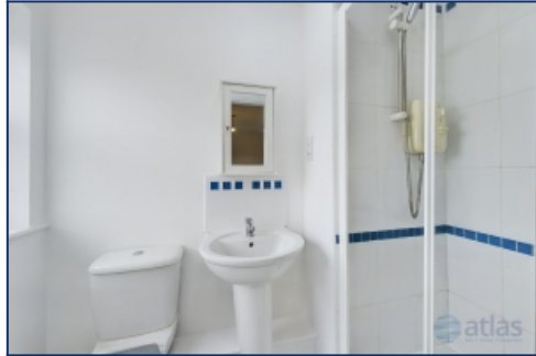
En Suite Shower Room