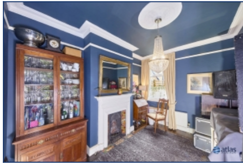
Back Reception Room