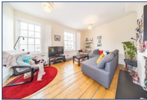
Bedroom (used As A Living Room)