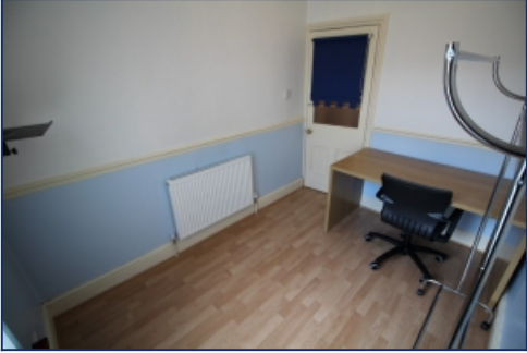
Front Bedroom 2