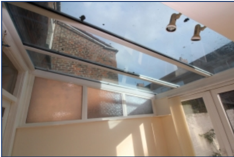
Kitchen Dining Area