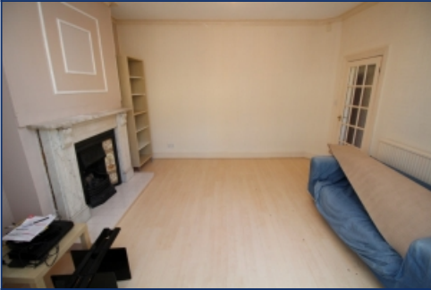
Front Living Room