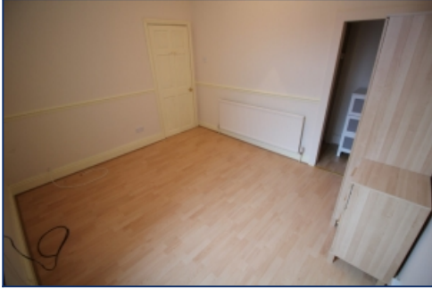
Back Bedroom 3