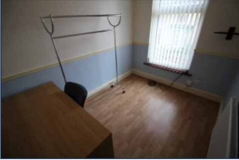
Front Bedroom 2