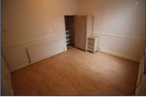
Back Bedroom 3