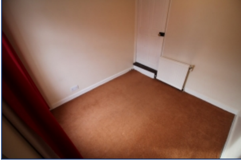
Back Bedroom 4