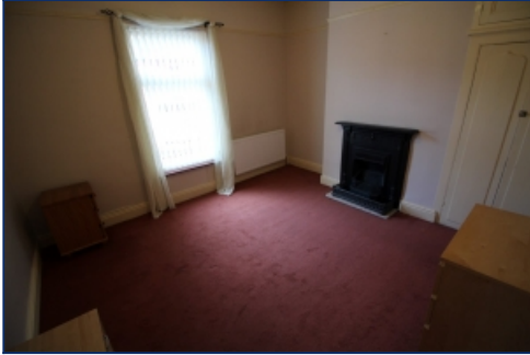
Front Bedroom 1