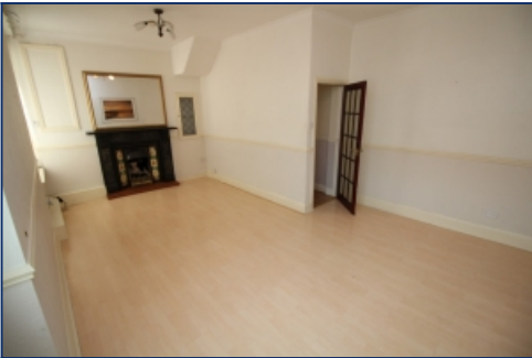
Back Dining Room