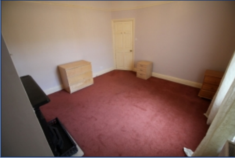
Front Bedroom 1