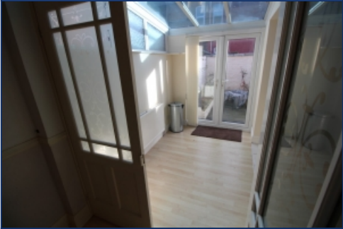
Kitchen Dining Area