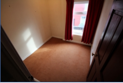
Front Bedroom 2