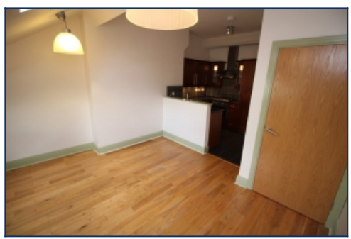
Bathroom Living Room Living Room / Kitchen