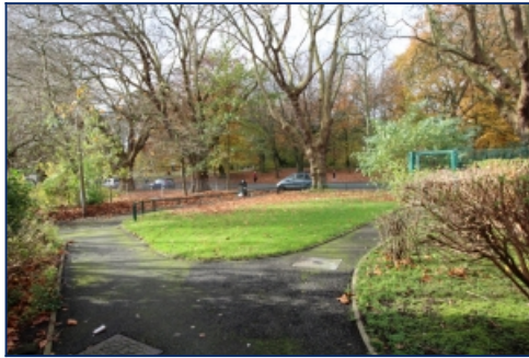
Views Of Sefton Park