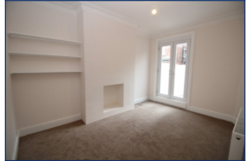
Rear Reception Room