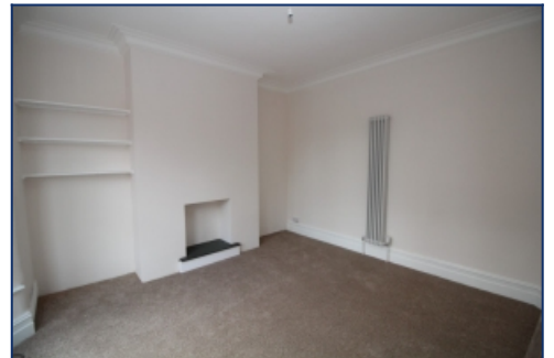
Front Reception Room