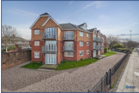
Side Elevation Of Property