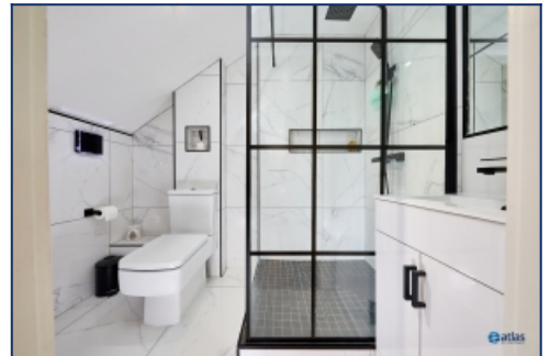
En-suite To Bedroom One