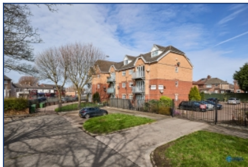
Rear Elevation Of Property