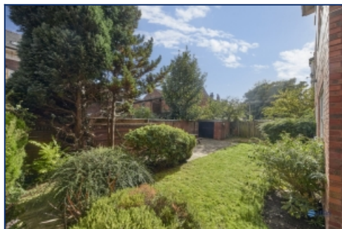
Back Communal Gardens