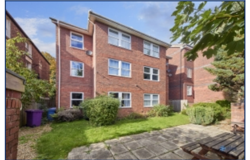
Back Communal Area