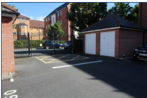
Electric Gates, Bike Store, Bin Store