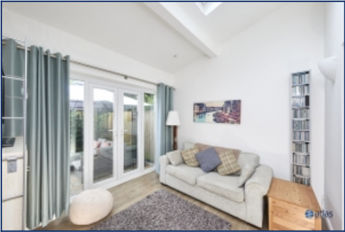
Back Reception Room

This charming semi-detached house on Martin Road is not just a home; it's a lifestyle. With its generous living spaces, modern amenities, and prime location, it promises to be a haven for any family. Don't miss the opportunity to make this your new home.