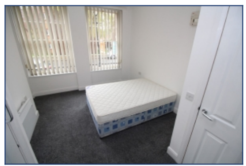
Bathroom Living Room Bedroom One