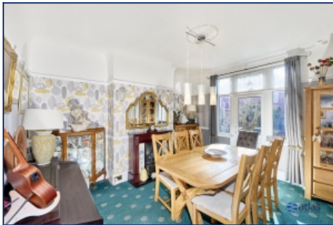
Reception Room 2