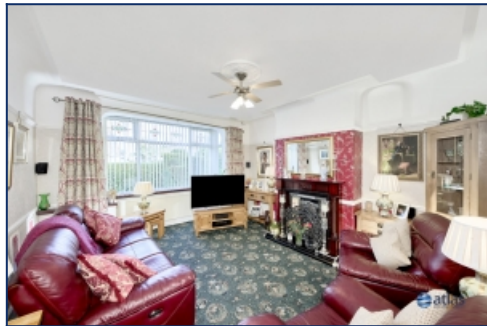
Reception Room 1