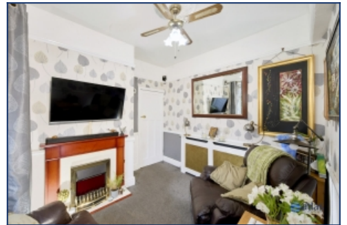
Reception Room 3