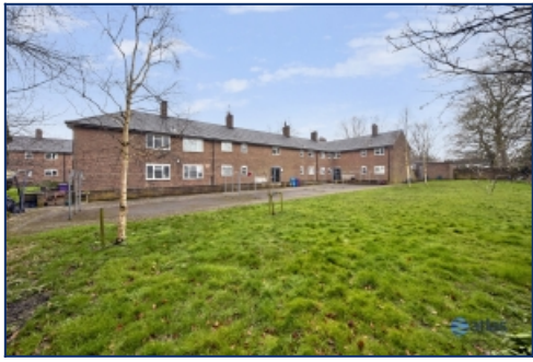
Back Communal Gardens