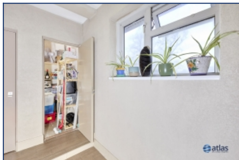
Separate Storage Room