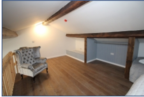
Bedroom Two / Study