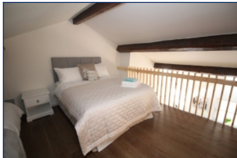
Bedroom Two / Study