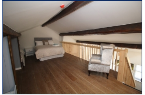
Bedroom Two / Study