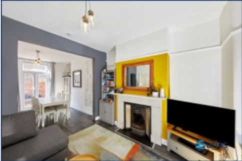
Living Room/Dining Room