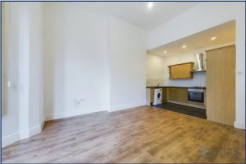
Lounge / Kitchen