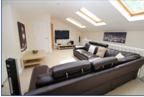
Mezzanine Living Room