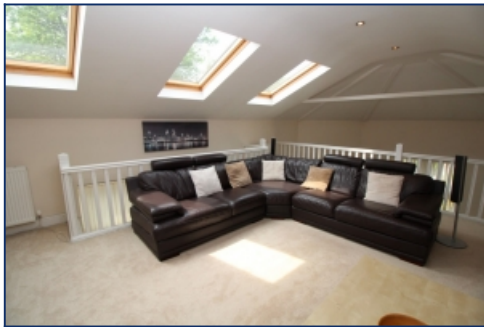
Mezzanine Living Room